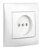
HWDCV2PS 1 Gang 2 Pin Socket Box: 10 Carton: 100