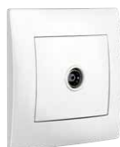
HWDCVTV 1 Gang Isolated TV Socket Box: 10 Carton: 100