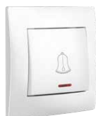
HWDCVBSL Bell Switch with LED Box: 8 Carton: 80