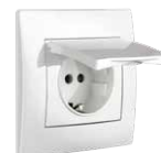
HWDCVSSC 1 Gang Schuko Socket with Cover Box: 6 ; Carton: 60