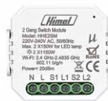
HHE2SM 2 Gang Switch Module Box: 1 Carton: 100