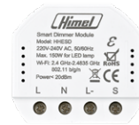
HHE2SD 2 Gang Dimmer Module Box: 1 Carton: 100