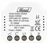
HHESM Smart Switch Module Box: 1 Carton: 100

Upgrade your Curvo Series switches with our WIFI Smart modules