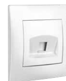
HWDCVTS 1 Gang Telephone Socket Box: 8 Carton: 80