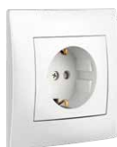
HWDCVSS 1 Gang Schuko Socket Box: 8 Carton: 80