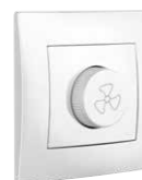
HWDCVFC 1 Gang Fan Control Box: 6 Carton: 60