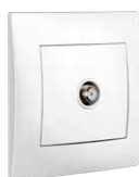
HWDCVSA 1 Gang Satellite Socket Box: 8 Carton: 80