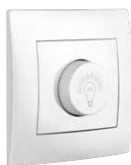
HWDCVLD 1 Gang Light Dimmer Box: 6 Carton: 60