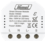
HHESD Smart Dimmer Module Box: 1 Carton: 100