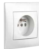
HWDCVFS 1 Gang French Socket Box: 8 Carton: 80